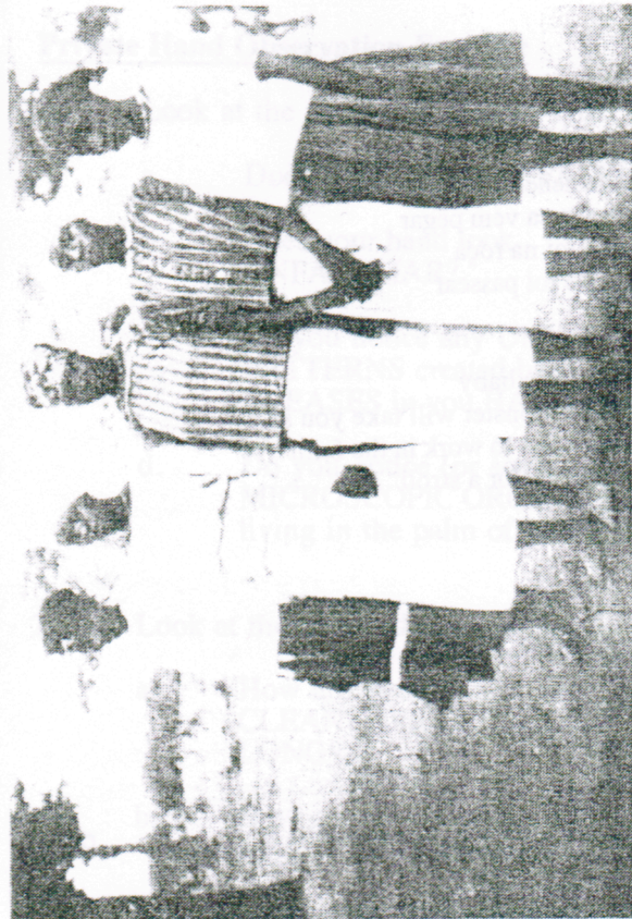
The Advance of Commodity Culture: Shona Women in 1896 and 1926.

From Lifebuoy Men, Lux Women: Commodification, Consumption and Cleanliness in Modern Zimbabwe by Timothy Burke. Durham: Duke University Press, 1996.